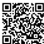
Official Notice Board