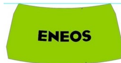
New mark as provided in SI 11 .

Yellow trapezoidal shape robotic marks ("Mark Set Bot": MSB)