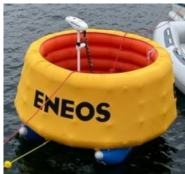
Mark 1 and 2